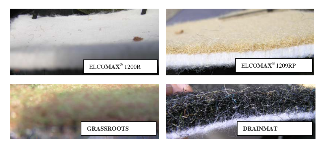
Figure 4. Geosynthetic 300mm square samples (ELCOMAX 1200R, ELCOMAX 1209RP, Grassroots, Drainmat)