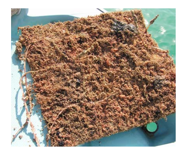
Figure 3. Non-woven composite sample after 4 months