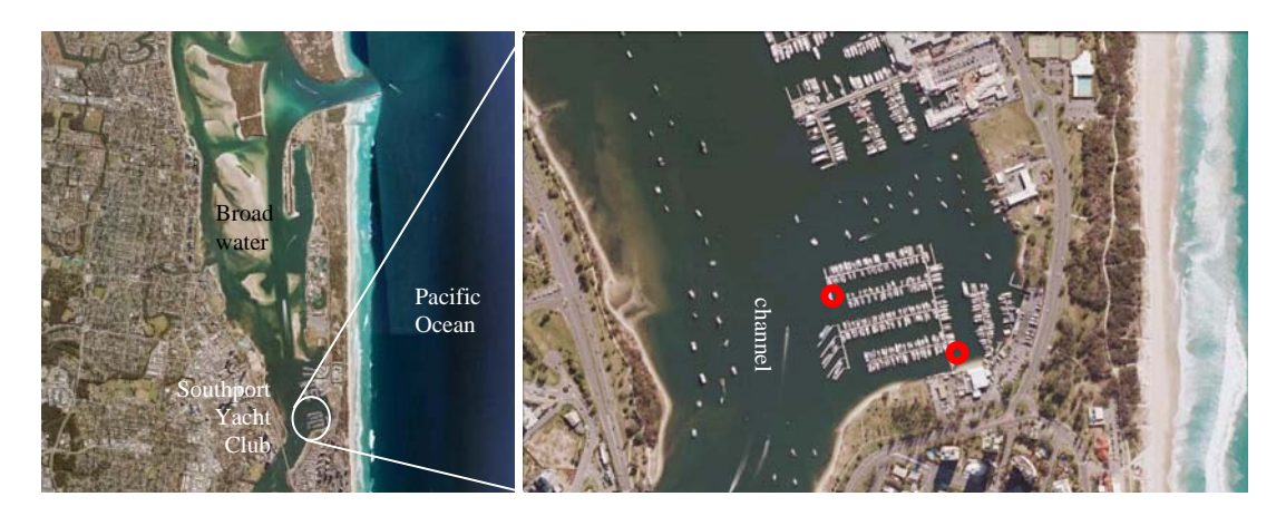
Figure 5. Location of deployment of Australian samples