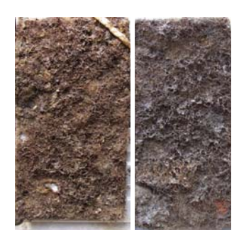
Figure 8. Samples from (a) top of outer pile and (b) bottom of outer pile after removal of major growth