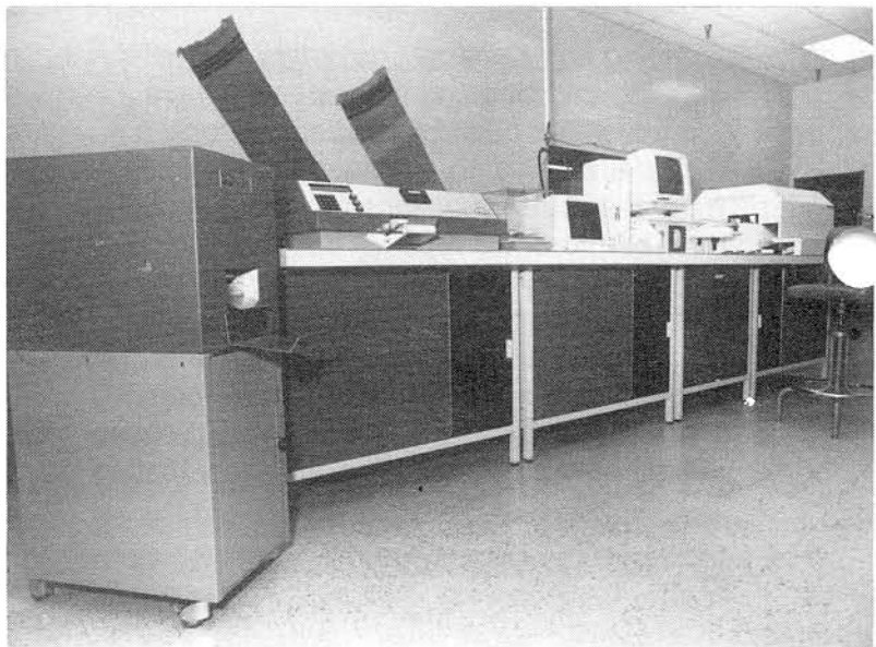
Shown above is the Shirley Developments FMT 3 (at left in photo) integrated with the Motion Control HVI 4000 Fiber Information System

Within the past two months we have installed and put into operation a new Motion Control HVI 4000 Fiber Information System and the latest Spinlab HVI 900 System. In addition, we have been fortunate to receive the cooperation of Shirley Developments Limited of Stockport, England to integrate FMT 3 Fineness/Maturity Testers with both of these high volume instrument systems. This arrangement will provide a means of obtaining fineness in millitex and percent maturity on all cotton samples along with the already established HVI measurements. We would like to express our appreciation to Spinlab, Inc., Shirley Developments Limited, and Motion Control, Inc., for their cooperation in placing these instruments in our laboratory.