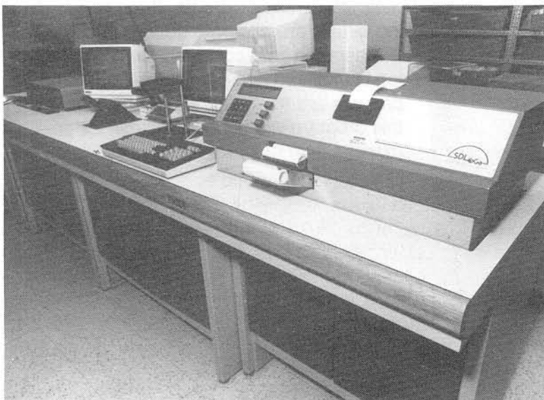
The Shirley FMT 3 has also been integrated with the Spinlab 900 HVI System, as seen in the photo at left