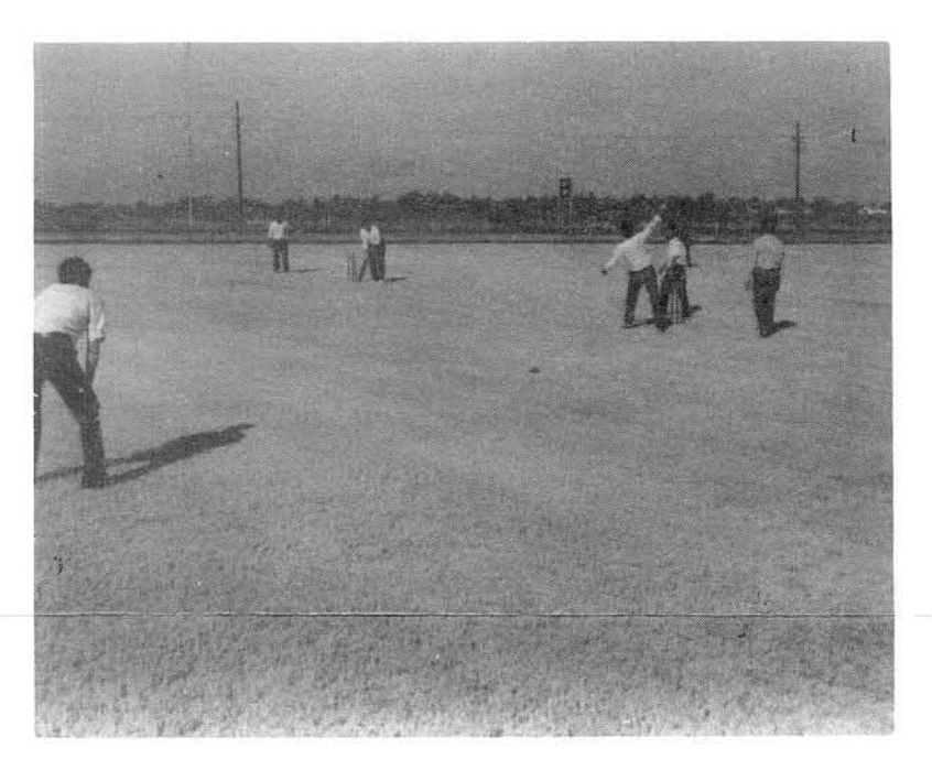
"Batter Up"?, "Play Ball"?, or Whatever

With that arrangement, the game began. The