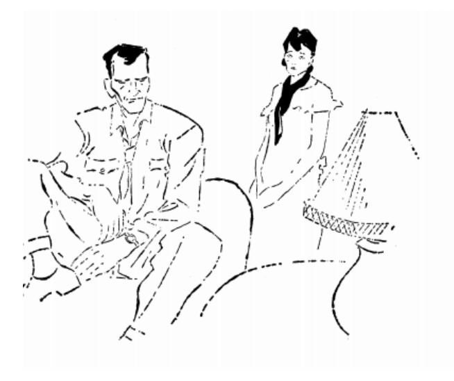
Figure 2: Patrick's Confession.

grocery store; and Mary's giggle in the living room, with the outlines of the detectives in the background. The <u>first and third illustrations</u> are especially striking in their contrast.