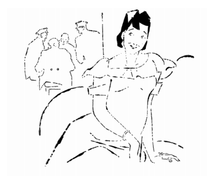
Figure 3: Mary's Giggle.