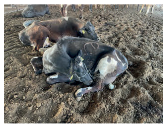
Figure 1. Example of how cattle were restrained for PCB euthanasia.

Assessment of clinical signs of consciousness began immediately following the first shot (min 0-1), and then continued nearly continuously after the second shot (min 1-2) until death was confirmed. All clinical observations and