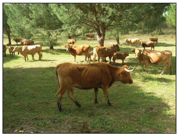
Figure 3. Cow with suspected oak toxicity showing weight loss and a marked submandibular edema.

Previous reports described a syndrome that affects calves born from dams that ingested large numbers of acorns under poor forage conditions during the second trimester