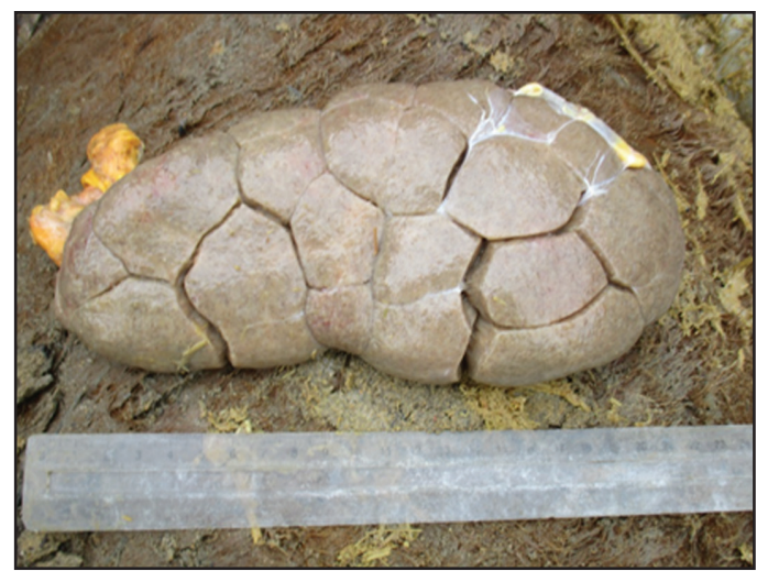
Figure 1. Severe fibrosis of a kidney from a cow with chronic oak toxicity, presenting granular irregular surface and abnormal greyish coloration.