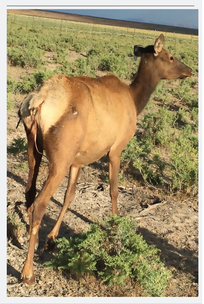
Figure 2: Dystocia in a cow. Calf has a posterior, dorsosacral presentation.

Placentophagia is common . It has been suggested that this a predatory defense mechanism. It has also been suggested, based on research in rats, that the placenta contains opioid-enhancing factor and that ingestion enhances opiate analgesia.<sup>3,14</sup>