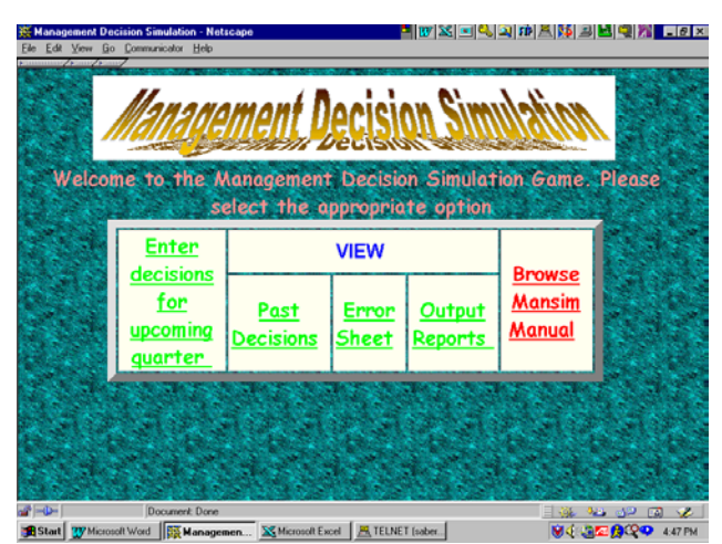
simulation game has similar objectives. However, since the delivery medium is via the web, it offers the added element of convenience and accessibility. Any student with a computer and access to the WWW is able to participate in the gaming simulation. Such a universal access is particularly essential for commuter students. Above we present the main web interface of the gaming simulation used. As can be seen, students are able to submit decisions, view their past decisions, view the results/outputs and also browse the online simulation manual.

As an instructional methodology, gaming has long been used for pedagogical purposes. This