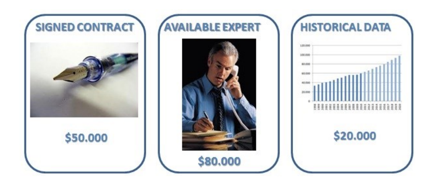
Table 3Reasons for justifying riskware realism