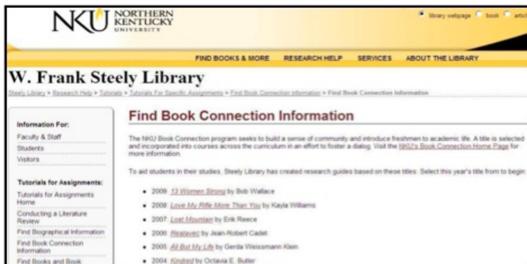
Figure 1: Book Connection Research Guide index page of online resources to Book Connection research

The library's involvement in the annual faculty workshop is praised by First-Year Programs staff and has become a regular part of the workshop each year. In addition to the faculty teaching tools created for the workshop, librarians also create several library assignments related to the Book Connection to be used in conjunction with University 101 classes and provide curriculum consultations to assist NKU's faculty in adding information literacy components to their teaching or assignments related to the Book Connection.