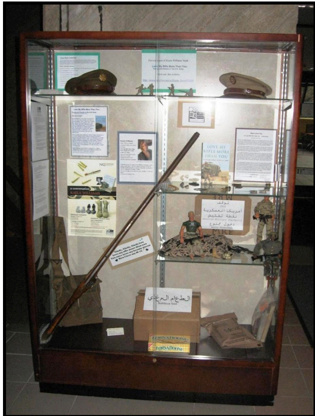
Figure 4: Display Case Example for 2009 selection Love My Rifle More Than You

Thirteen Women Strong (a history of NKU's award winning women's basketball team), the display case featured NKU spirit paraphernalia, NKU yearbooks, a basketball, and a WNBA Barbie with basketball goal. These creative exhibits require no expense, provide an additional component, and add a sense of community to the Book Connection Program.