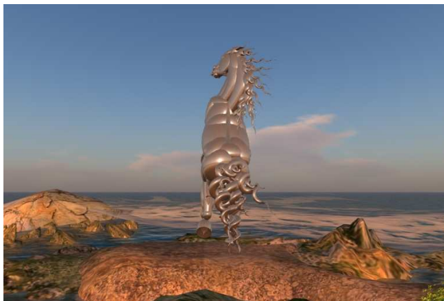
Figure 6: One of the horse statues on Shengri La Gallery also licensed to Intel Labs for use on ScienceSim.

This test case varies, as well, in the amount of management oversight and documentation required, which would be prohibitive to a commercial license. Moving a new tree or flower to a grid under a commercial license should be a simple matter; moving content onto ScienceSim requires documenting its originality down to the original pixel, maintaining a file of email agreements and documentation about how the tree is to be used, and lastly, moving an entire OAR file to a special region, where the tree has its creator tags preserved and it can be collected into the inventory database by the creator. The process is time consuming and requires manual processes that will need to be automated before it can be effective for a commercial license.