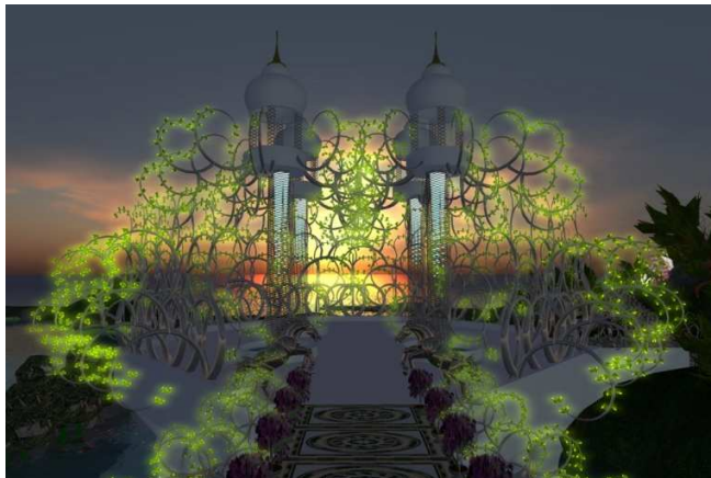
Figure 5: The test case: Shengri La Spirit licensed to Intel Labs for use for performance testing.

What is missing, then, are legal definitions which can be used to create contracts which will withstand scrutiny in the event of a legal challenge, an understanding of the content creators about how they need to protect their own work both prior to and after releasing it as licensed content, education about what can and cannot be protected, and standards for both this sort of content and for legal agreements that govern engagements between content creators and virtual world operators.