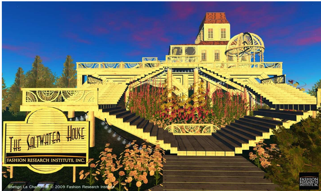
Figure 6: The Saltwater House on Shengri La Chamomile. Shengri La Chamomile was created in situ and served as another test case for content management on public grids.

Until content creators have the ability to recognize themselves as professionals, it will continue to be difficult for them to protect their work as professional output which can be sold, licensed, and otherwise protected. While this may seem to be a minor point, marketers everywhere would agree that brand identity is a critical tool in their toolkit.