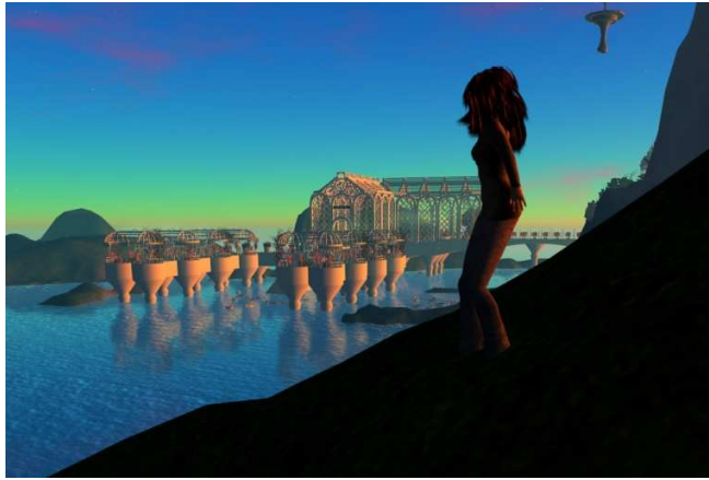
Figure 1: The noted Shengri La Spirit build, shown on the ScienceSim grid as hosted by Intel Labs.

By Shenlei E. Winkler, Fashion Research Institute, USA