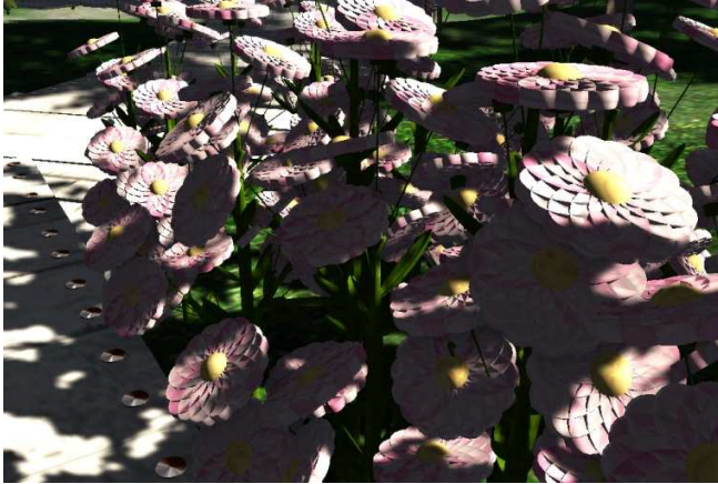
Figure 3: Details of the Shengri La Chamomile build Saltwater House garden.