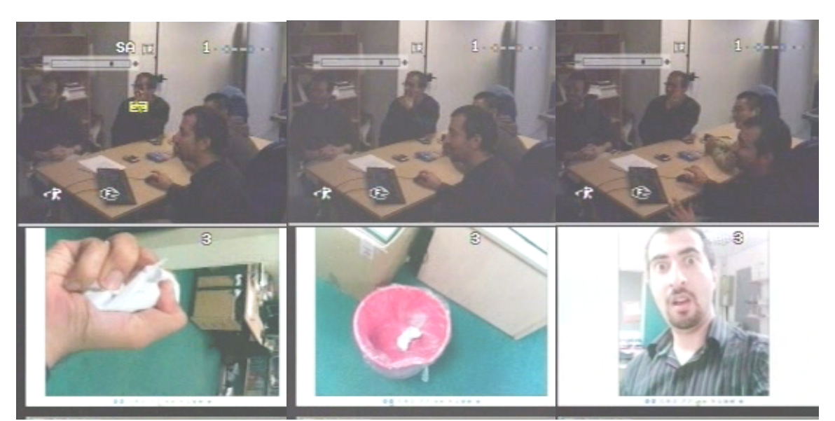
Figure 1: Excerpts from Video from Group Meeting (top) with Simultaneous Capture of story boards from Computer Screen (bottom)

The participants used a range of media and tools to support the task. Paper based notes were commonly made in and away from meetings, despite the presence of the Smartphones intended for this purpose. When asked how they had used the smartphone, participants responded that it was largely unused, because it was neither large enough to support easy note taking, nor small enough to be easily carried. Its multimedia capabilities were again considered inadequate for producing the video, however the devices were used in several cases to capture images for use as storyboards, describing ideas for the script. Figure 1 below shows a participant explaining an idea for the film, making use of images taken from the device and displaying them on the large screen PC during a meeting.