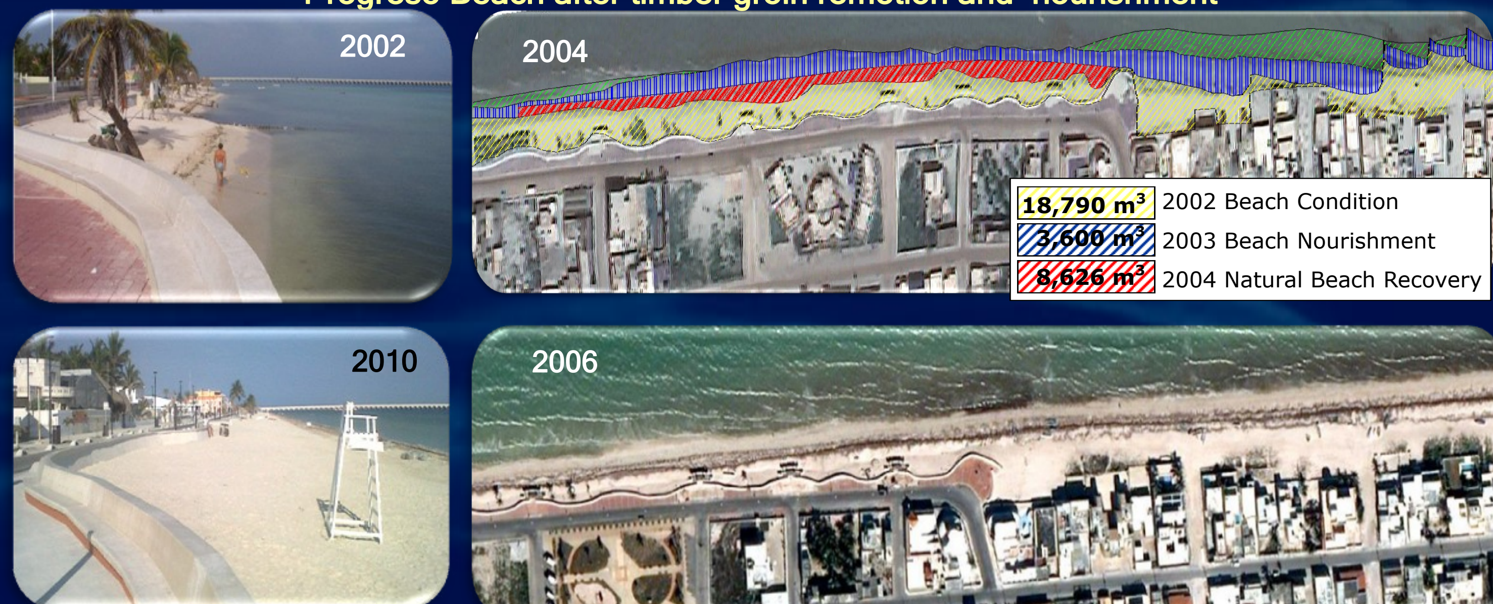
Fig 2. Based-engineering efforts for long term beach rehabilitation at Yucatan coast